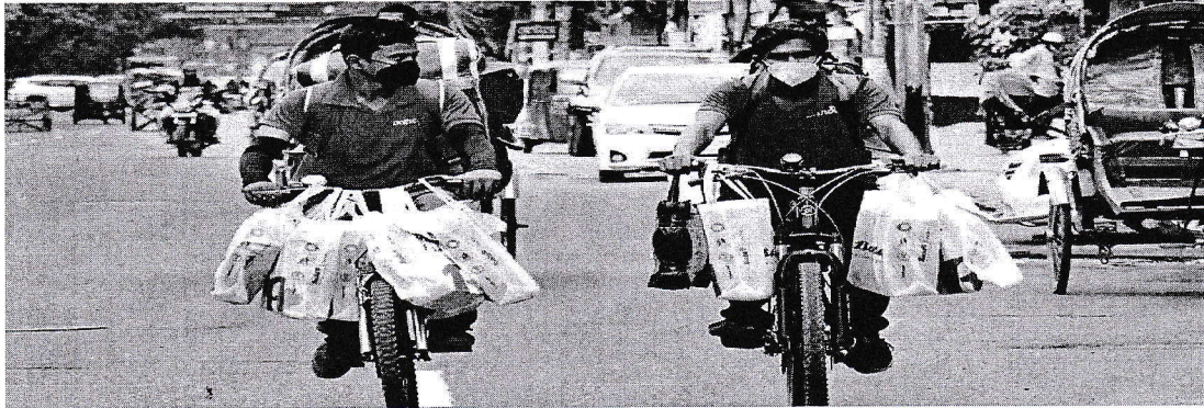
Caption: Dhaka's Love for Deliveries.

Write a short essay of 1000 words based on the above picture. Please use your imagination while writing the essay. (Mark: 10)